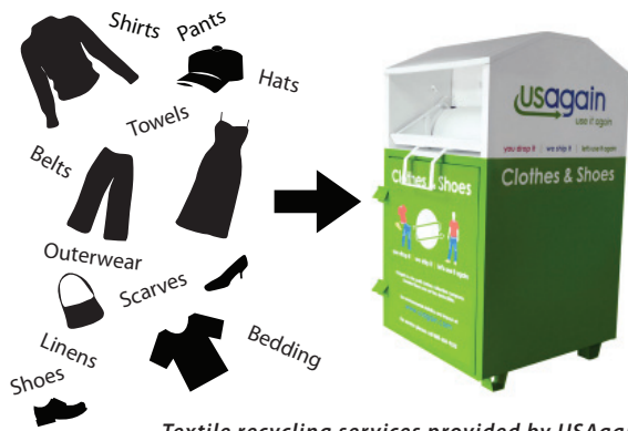
Textile recycling services provided by USAgain.

convenient locations across the US where you can recycle textiles any time of the day, any day of the year. By putting textiles back in the “use cycle” we conserve precious natural resources, prevent greenhouse gas emissions and save landfill space. What’s more, the clothes are given a second life at affordable prices for people who can’t afford brand new clothes. Textile recycling is a win-win proposition. For more information please visit www.usagain.com .